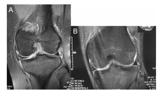
Fig. 2 A, The MRI of left knee of 42 years old female was reported as focally increased signal intensity which was suspicious for grade 2 tear. B, The MRI of 21 years old male was reported as longitudinal complex tear of body of medial meniscus of left knee without grading specified. Subsequently, the meniscus appeared intact during the arthroscopic ACL reconstruction

as grade 2 tear or degenerative tear, it would be included into the indefinite meniscal tear group (Fig. 2). If it was described as a flap, complex, bucket handle (abnormal morphology of the meniscus) or grade 3 tear (high signal inside the meniscus and abutting an articular surface)<sup>(7)</sup>, it would be included into the group of definite meniscal tear (Fig. 3). All the arthroscopic surgeries were done by an experienced orthopedic surgeon (AL) who regularly performed the arthroscopic knee procedure. The MRI result was compared with intraoperative finding that was used as a standard reference and was classified into true-positive, true-negative, falsepositive and false-negative categories. A statistical analysis was carried out by Statistical Package for the Social Sciences (SPSS) software. The present study was approved by the ethics committee for human research of Naresuan University.